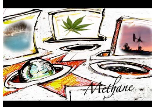
Figure 5: The three open pipeline chutes. Figure 6: The alternative energy targets; methane, hemp, and wind