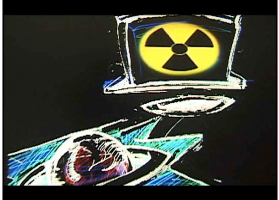
Figure 7: Planning the opening of the MacKenzie Valley Pipeline Figure 8: The Pipeline Target Holes Figure 9: The Global Clients | Figure 10: The nuclear target hole