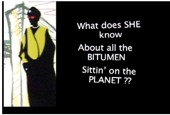
Figure 13: "Let's Go Alberta! | Figure 14: The Spies say, "What does she know?"