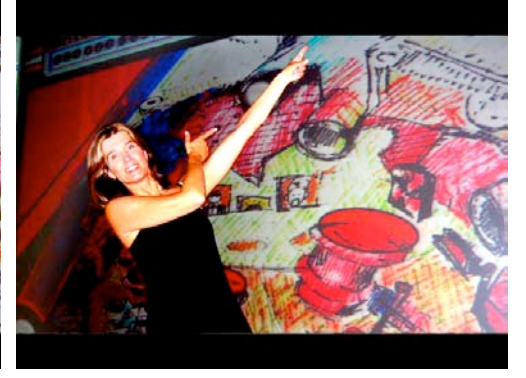
Figure 1: The Lori character describing the game action, "Talking Head" variation. Figure 2: The Lori character describing the game action, "Alter Ego" variation. Figures 3 and 4: Imagine a pinball game as big as a wall.