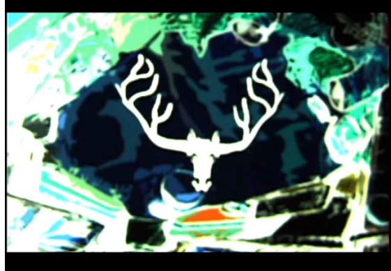
Figure 11: The spies in the oilpatch | Figure 12: Dancing caribou